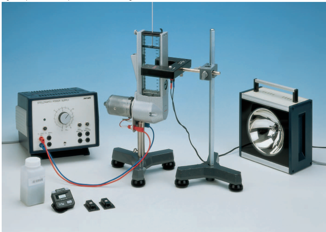
Fig. 1: Experimental set-up for the barometric height formula.

The experimental set up is as shown in Fig. 1. The kinetic theory apparatus is filled with about 400 steel balls. (Approximately one layer of balls) The plunger is set to maximum volume. The speed of rotation – and hence the vibrational frequency – is adjusted by means of the power supply and measured with the stroboscope (stationary image of the vibrating plate). The maximum speed of rotation of 3000 \text{ min}^{-1} should not be exceeded. Using the forked light barrier with counter, the number of balls which pass the beam of light in the prescribed time is counted (an area of approx. 0.4 \text{ mm}^2 is used). Immediately above the vibration plate the probability of several balls passing through is very high. It is therefore recommended that the measurements are started at a height of only about 3 cm above the vibration plate.